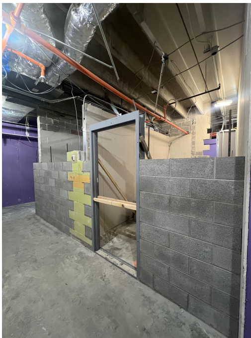
Setting door frames for masonry on level 2.