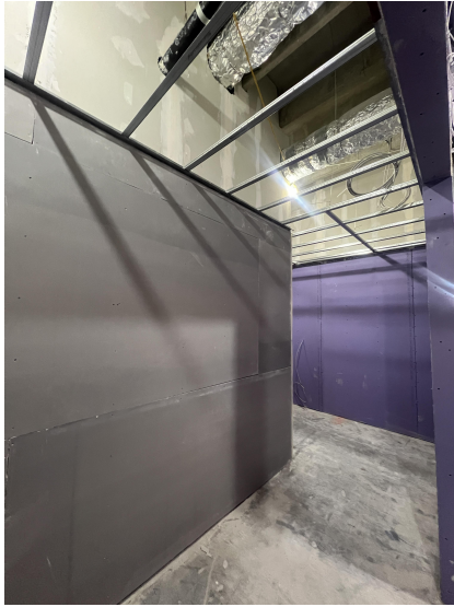
Concrete pads installed for electrical units on level 2.