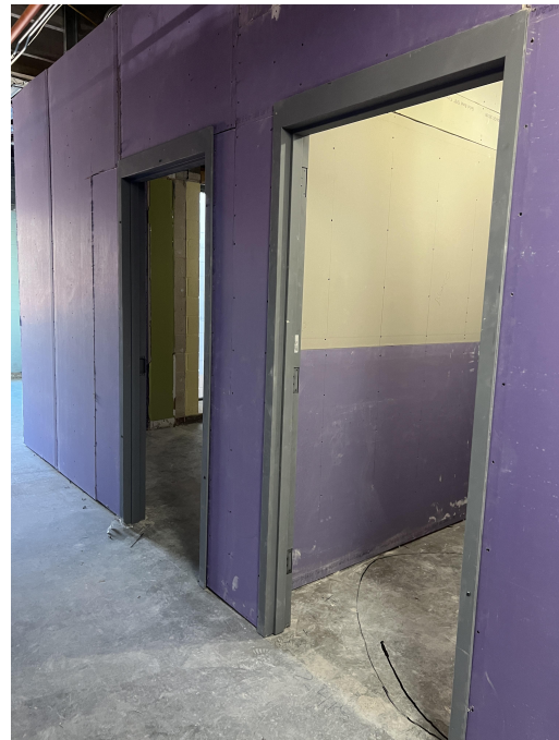
Setting door frames in classrooms on level 2.